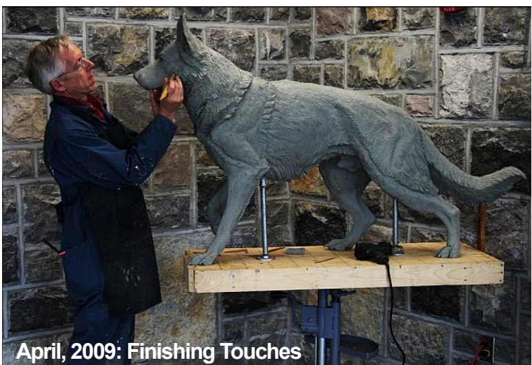
April, 2009: Finishing Touches