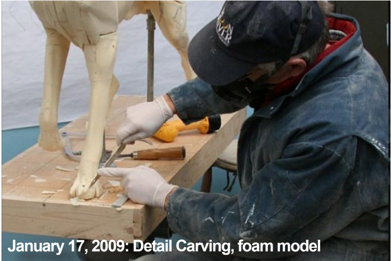
January 17, 2009: Detail Carving, foam model