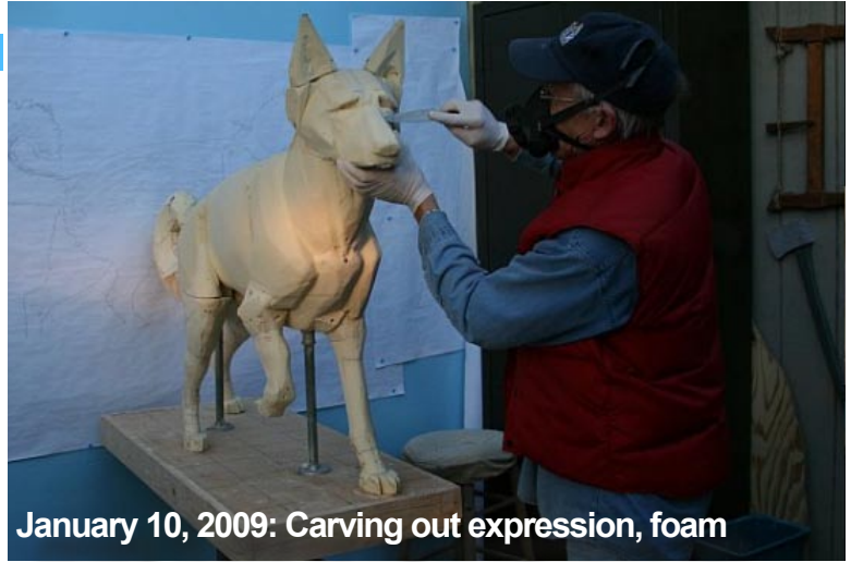
January 10, 2009: Carving out expression, foam