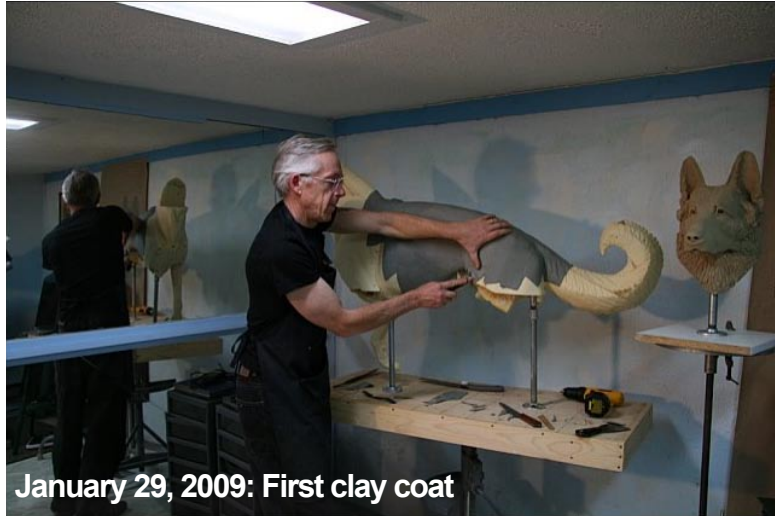
January 29, 2009: First clay coat