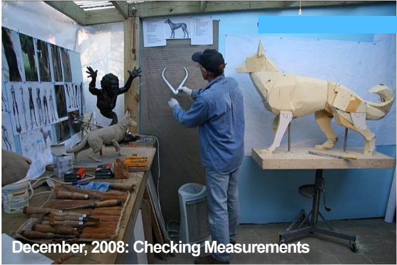
December, 2008: Checking Measurements