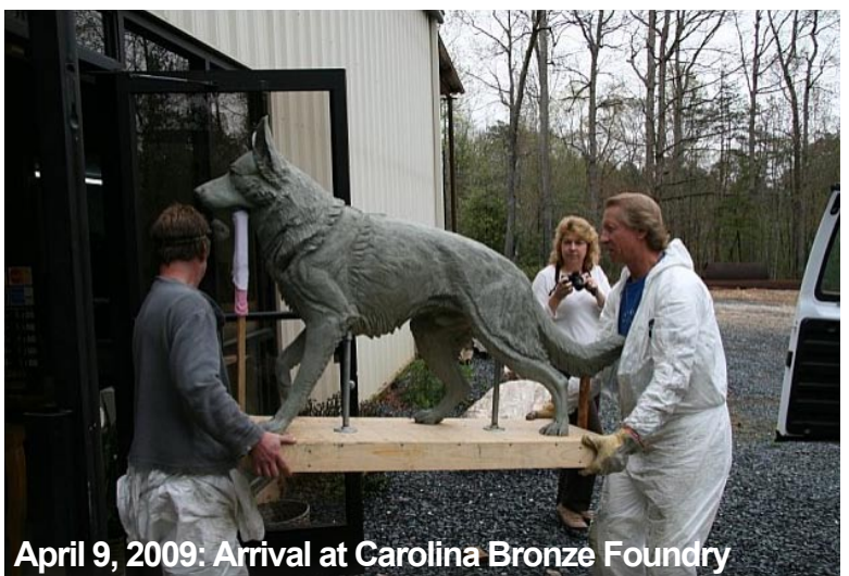
April 9, 2009: Arrival at Carolina Bronze Foundry

Medium: Plastilene (pictured model); Bronze (completed work)